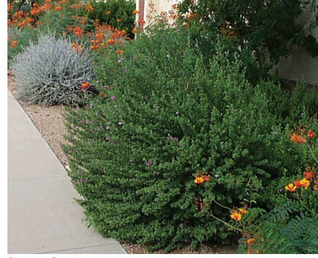
Seasonal Pruning stimulates natural growth and produces more blooms.

This type of pruning is recommended by the Arizona Landscape Contractors' Association as well as the Arizona Municipal Water Users Association. In addition to being healthier for the plant, Sustainable Shrub Pruning can also boost curb appeal. It leads to more vibrant green foliage and allows residents to enjoy more seasonal blooms because plants are not being trimmed during their flowering season.