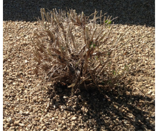
During shrub renovation, plants are cut back to roughly 12"-18" above ground.