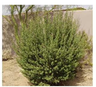
This healthy Sage reached its peak size at the end of the growing season.