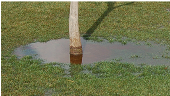
Take advantage of rainfall. Turn irrigation clocks off and monitor soil moisture and plant condition to determine when more water is needed

First, inspect your irrigation system by turning the system on and walking around your yard; you can turn your irrigation system on manually from your controller or your valve box. Make sure water is only being used to water plants and not creating wet spots where plants are not. If you see water leaving the system where no plant is present, you may be able to solve the problem by plugging the ¼" irrigation drip tube that is commonly used. The appropriate plugs are available at any hardware store. Also, check the location of drip emitters, as these can easily be moved by pets and yard maintenance activities. Position emitters to supply water to the entire root zone, which is typically about 50% larger than the top of the plant. If plants are on a slope, make sure to position the emitter on the high side of the root ball to take advantage of the water flowing downhill.