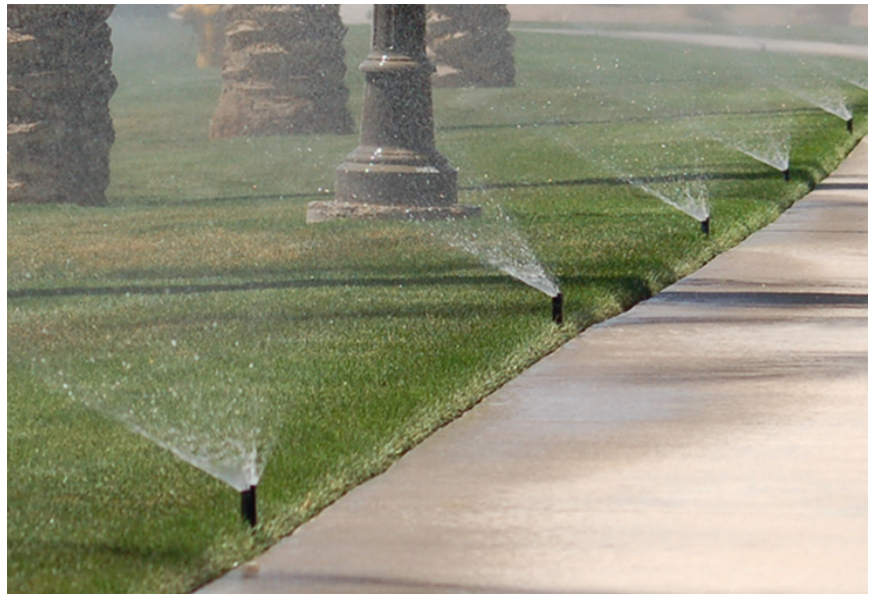
Make sure all nozzles are pointing in the right direction to ensure the intended area is being sprayed

If you have turf, make sure sprinkler heads pop-up and are not stuck in the ground. You should also check to see that heads are pointed in the right direction and are spraying the intended pattern. Nozzles can become clogged by sand, rocks or other debris which you may be able to clean out with a screwdriver or pocketknife. If you cannot unclog the nozzle, replacement is necessary.