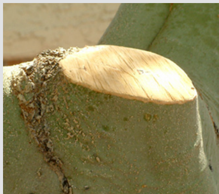
A fresh cut done properly with the right tools will promote the health of the tree