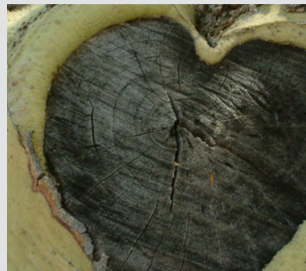
A proper cut will heal quickly and put as little strain on the tree as possible

For large trees or if you are in doubt, call a Certified Arborist. An Arborist can determine what type of pruning is needed and provide the service of a trained crew with the appropriate safety equipment and liability insurance.