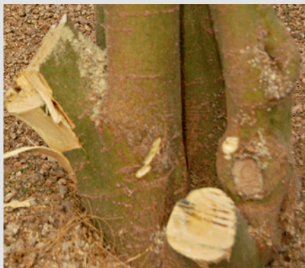
Bad cuts can severely damage trees and stunt their growth