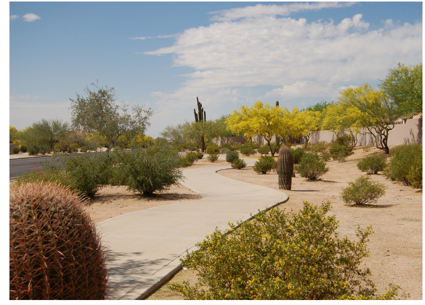
Xeriscape highlights plants that are native to and thrive in the Southwest region.

We encourage you to do your own research. Find out what your Community Association allows and if your city offers rebates for landscape conversion. Compare artificial turf companies, as each will have different costs,