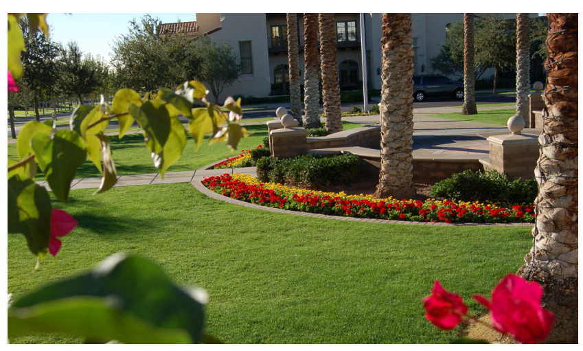
A natural lawn that is properly maintained at a community in the Phoenix area.

Lower install costs. A natural lawn can cost about $1 per square foot to install, while artificial turf averages around $6 to $8 per square foot.